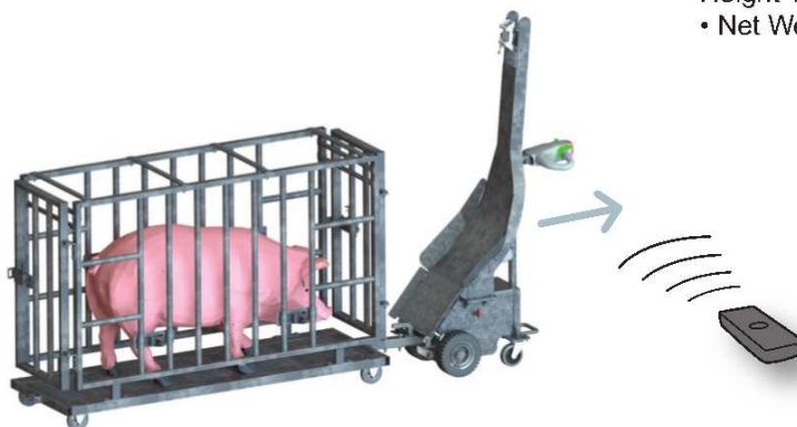
Distance guidance by remote control for moving boar ahead the sows