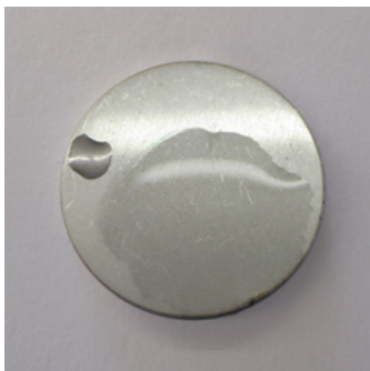
1. Stainless steel surface moistened with water.

You can immediately spot any contaminated areas by a simple visual inspection just after spraying BioFinder on the facilities' surfaces.