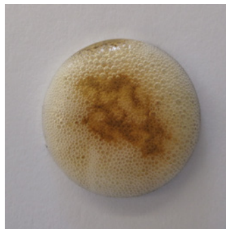
3. Positive reaction after using BioFinder on a surface contaminated with biofilms.